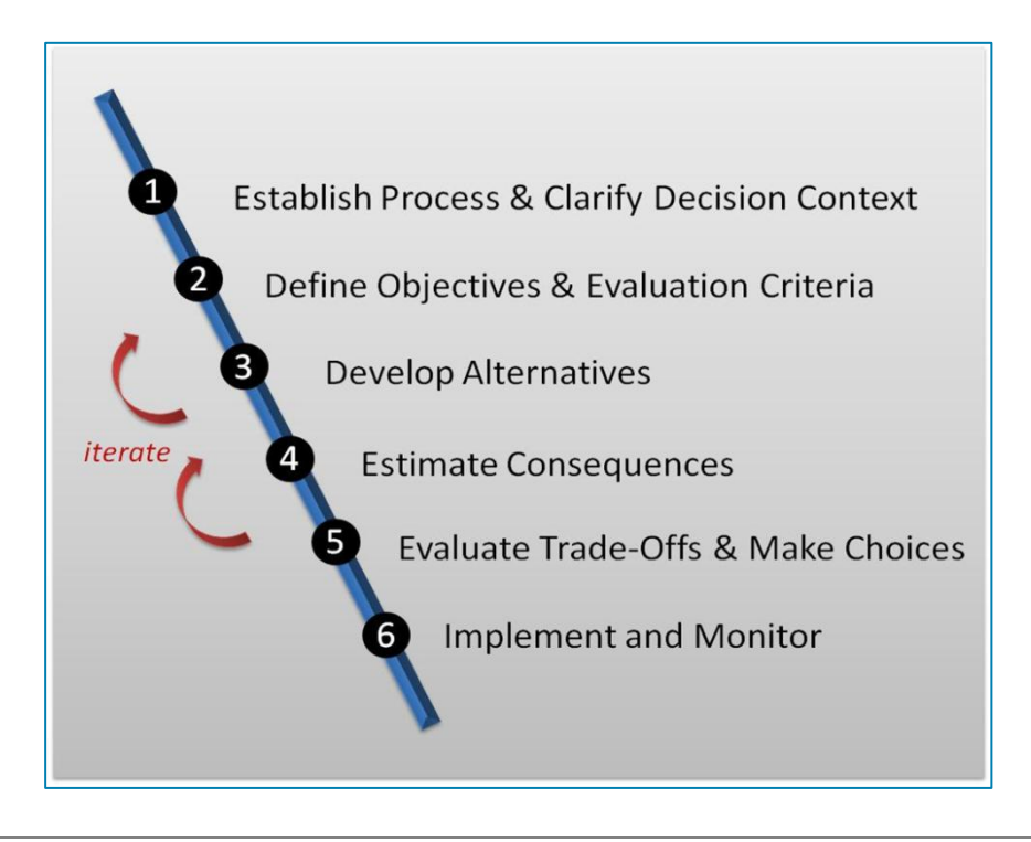
Figure 1 Steps in Structured Decision Making

technically intensive decisions and difficult group dynamics. What exactly is done at each step, to what level of rigour and complexity, will depend on the nature of the decision, the stakes and the resources and timeline available. In some cases, the appropriate analysis may involve complex modeling spanning months or years; in others it will involve structured elicitations of expert judgment conducted over several days. In still others, a careful structuring of objectives and alternatives may be all that is needed to clarify thinking around a particular decision and a qualitative analysis will suffice. A key point is that structured methods do not have to be time consuming; even very basic structuring tools and methods can help to clarify thinking, minimize biases and counter the negative effect of simplifying heuristics adopted by decision makers who are otherwise rushed through complex judgments.